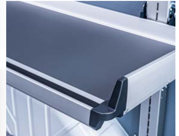
On request, we can also offer a CO 2 -neutral delivery option for the FlexRack 2.0: reduced carbon footprint, thanks to CO 2 -neutral production using recycled material