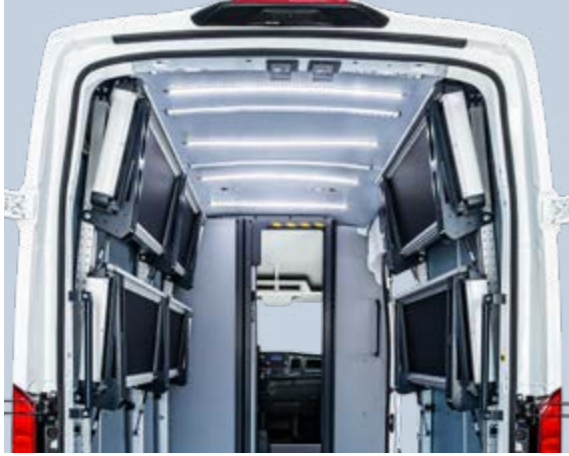
Optimum use of the loading space, as the system can be adapted to the shape of the vehicle