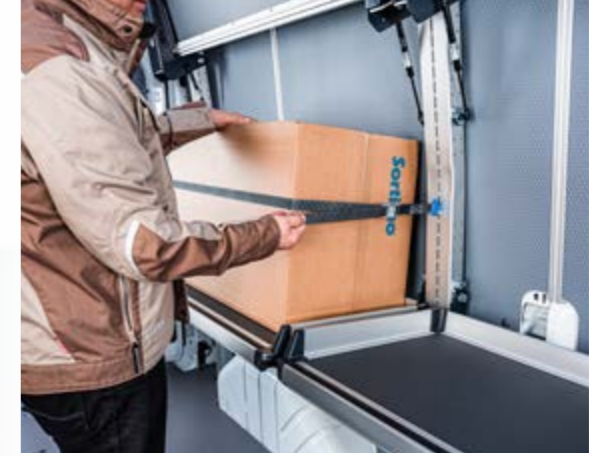
Time savings due to integrated load securing with ProSafe